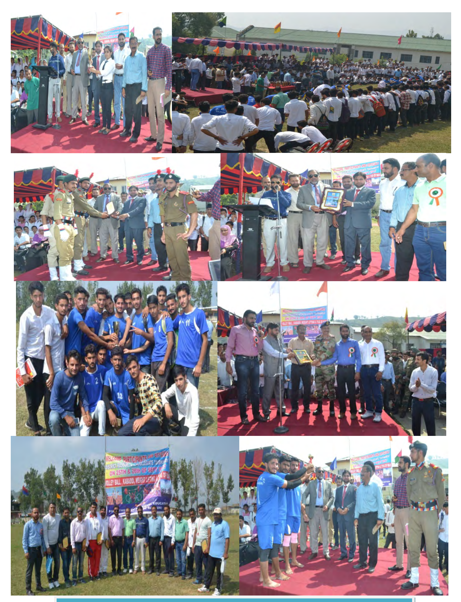
\underline{Inter\ Collegiate\ Sports\ Mela\ on\ 26^{th}\ of\ Sept.\ 2017\ during\ prize\ distribution\ ceremony}