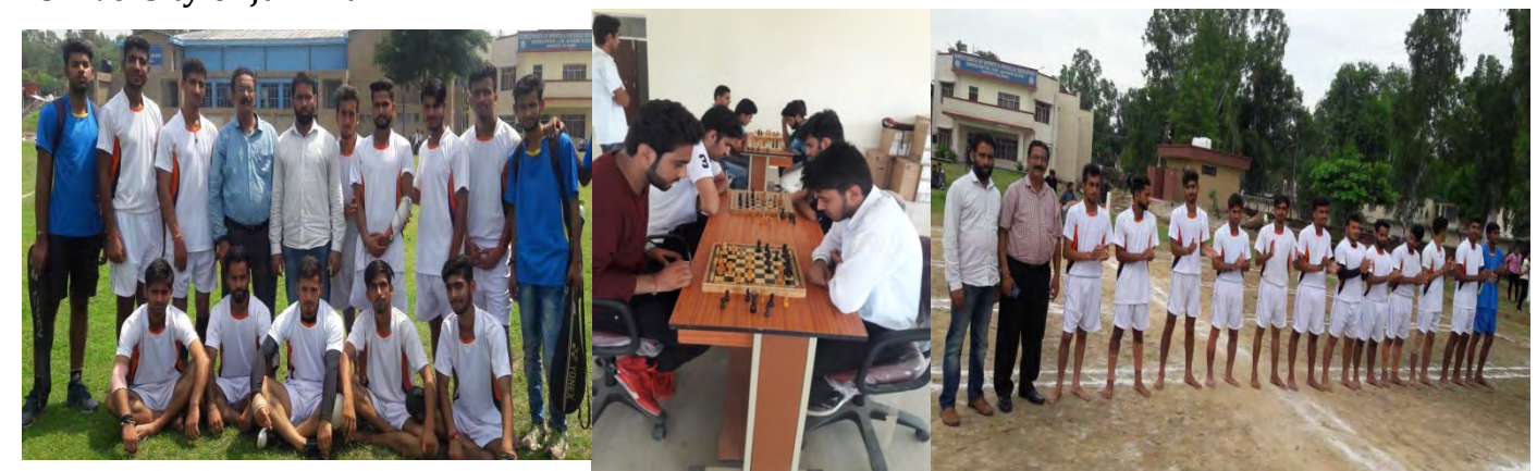
h) On 25<sup>th</sup> and 26<sup>th</sup> of September 2017, District Inter Collegiate Sports Mela held at Govt. P.G. College Rajouri.

g) Our College teams participated during session. In Chess (22/08/2017), Table Tennis (23/08/2017). Kho-Kho 04/09/2017, Badminton (05/09/2017), foot Ball (11/09/2017), Volley Ball (24/10/2017) inter-collegiate tournaments held at University of Jammu.