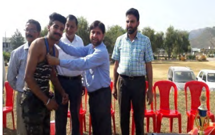
GOVT. P.G. COLLEGE RAJOURI SHINES IN INTERCOLLEGIATE WEIGHTLIFTING CHAMPIONSHIP.

On 09/11/2017 Govt. P.G. College Rajouri excelled in the Intercollegiate weightlifting championship held under the banner of directorate of Sports and physical education. University of Jammu the college athletes performed well taking away overall championship trophy in weightlifting and win a good number of medals. In other individual's events of power lifting, boxing, Judo, Cross country and wrestling all there inning at athletes were given a special feel